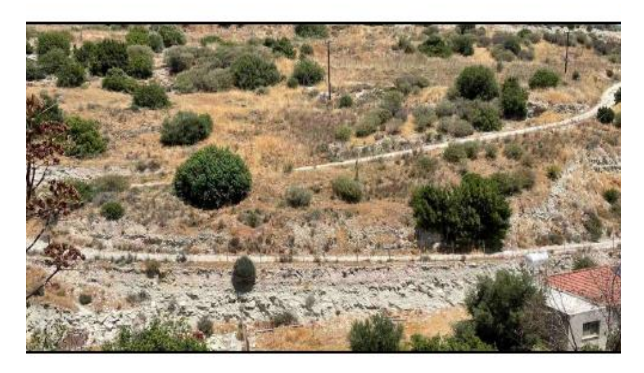
BANK OF CYPRUS PUBLIC COMPANY LTD (BOC) has made every reasonable effort to confirm and/or verify the information in this document. It is noted, however, that (a) this information was obtained from public records and/or third parties without the possibility of confirming their accuracy; and (b) BOC neither has possession nor is the owner of the property for sale, therefore the details in this document are provided solely for information purposes, without assuming any responsibility and/or duty and/or obligation by BOC to any person who may become aware of them. BOC strongly urges and/or strongly suggests that, with the help of specialized consultants of their choice, any Interested Buyers, conducts their own investigations and/or on-site examination of the property for sale to verify and/or obtain personal knowledge of all information and data that may affect the decision to participate in the upcoming auction of the property for sale