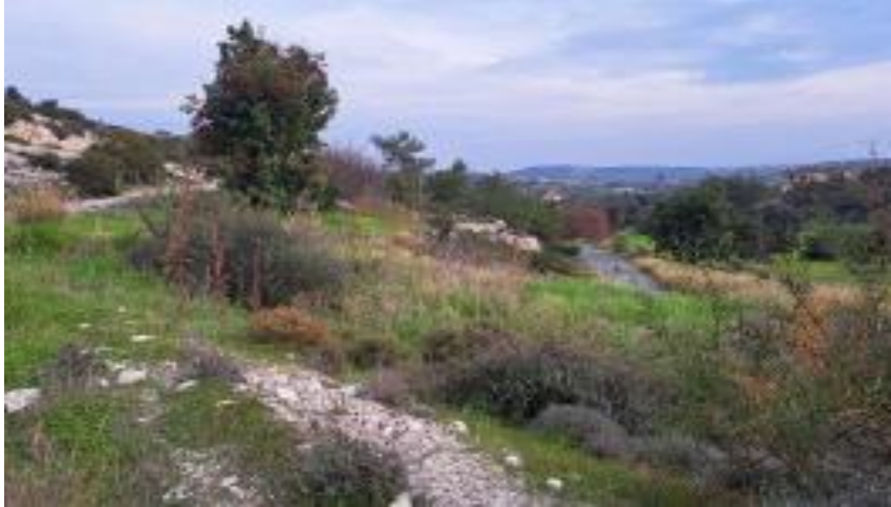
BANK OF CYPRUS PUBLIC COMPANY LTD (BOC) has made every reasonable effort to confirm and/or verify the information in this document. It is noted, however, that (a) this information was obtained from public records and/or third parties without the possibility of confirming their accuracy; and (b) BOC neither has possession nor is the owner of the property for sale, therefore the details in this document are provided solely for information purposes, without assuming any responsibility and/or duty and/or obligation by BOC to any person who may become aware of them. BOC strongly urges and/or strongly suggests that, with the help of specialized consultants of their choice, any Interested Buyers, conducts their own investigations and/or on-site examination of the property for sale to verify and/or obtain personal knowledge of all information and data that may affect the decision to participate in the upcoming auction of the property for sale