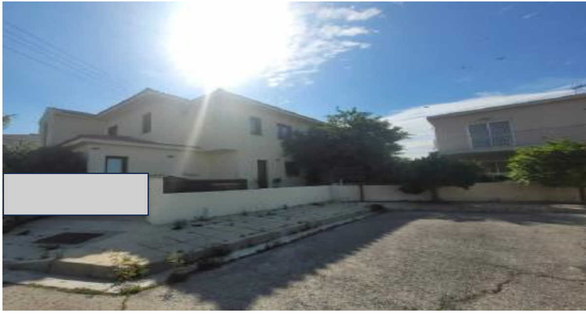
BANK OF CYPRUS PUBLIC COMPANY LTD (BOC) has made every reasonable effort to confirm and/or verify the information in this document. It is noted, however, that (a) this information was obtained from public records and/or third parties without the possibility of confirming their accuracy; and (b) BOC neither has possession nor is the owner of the property for sale, therefore the details in this document are provided solely for information purposes, without assuming any responsibility and/or duty and/or obligation by BOC to any person who may become aware of them. BOC strongly urges and/or strongly suggests that, with the help of specialized consultants of their choice, any Interested Buyers, conducts their own investigations and/or on-site examination of the property for sale to verify and/or obtain personal knowledge of all information and data that may affect the decision to participate in the upcoming auction of the property for sale