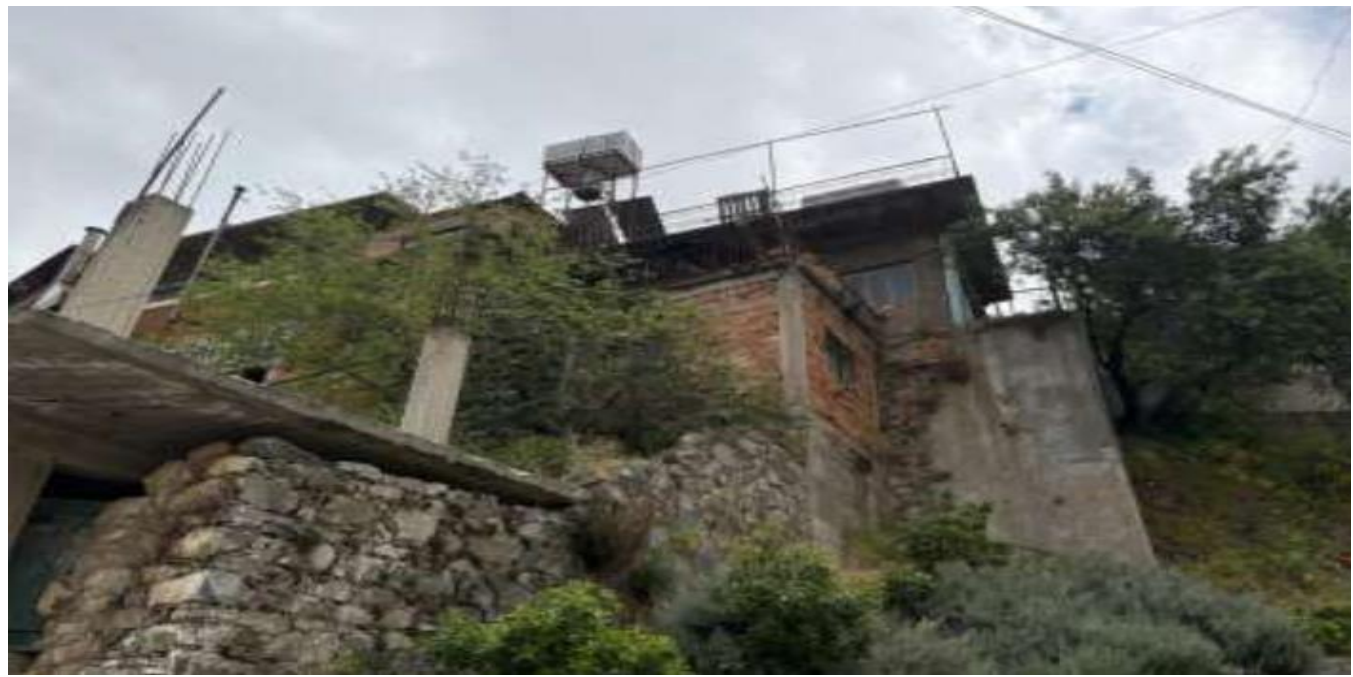
BANK OF CYPRUS PUBLIC COMPANY LTD (BOC) has made every reasonable effort to confirm and/or verify the information in this document. It is noted, however, that (a) this information was obtained from public records and/or third parties without the possibility of confirming their accuracy; and (b) BOC neither has possession nor is the owner of the property for sale, therefore the details in this document are provided solely for information purposes, without assuming any responsibility and/or duty and/or obligation by BOC to any person who may become aware of them. BOC strongly urges and/or strongly suggests that, with the help of specialized consultants of their choice, any Interested Buyers, conducts their own investigations and/or on-site examination of the property for sale to verify and/or obtain personal knowledge of all information and data that may affect the decision to participate in the upcoming auction of the property for sale