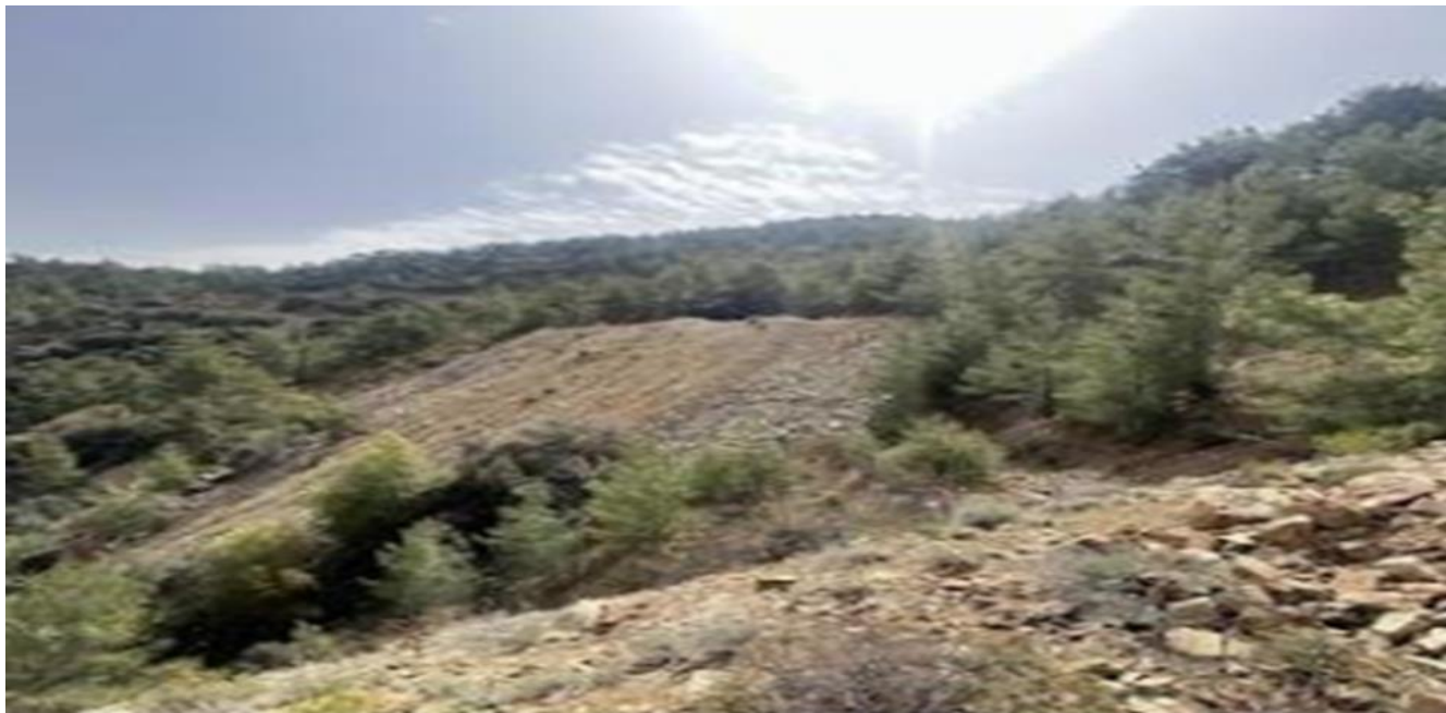
BANK OF CYPRUS PUBLIC COMPANY LTD (BOC) has made every reasonable effort to confirm and/or verify the information in this document. It is noted, however, that (a) this information was obtained from public records and/or third parties without the possibility of confirming their accuracy; and (b) BOC neither has possession nor is the owner of the property for sale, therefore the details in this document are provided solely for information purposes, without assuming any responsibility and/or duty and/or obligation by BOC to any person who may become aware of them. BOC strongly urges and/or strongly suggests that, with the help of specialized consultants of their choice, any Interested Buyers, conducts their own investigations and/or on-site examination of the property for sale to verify and/or obtain personal knowledge of all information and data that may affect the decision to participate in the upcoming auction of the property for sale