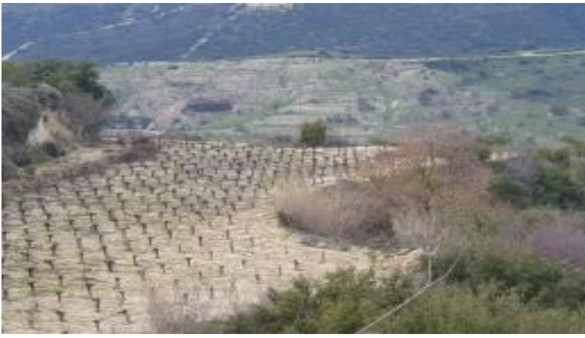
BANK OF CYPRUS PUBLIC COMPANY LTD (BOC) has made every reasonable effort to confirm and/or verify the information in this document. It is noted, however, that (a) this information was obtained from public records and/or third parties without the possibility of confirming their accuracy; and (b) BOC neither has possession nor is the owner of the property for sale, therefore the details in this document are provided solely for information purposes, without assuming any responsibility and/or duty and/or obligation by BOC to any person who may become aware of them. BOC strongly urges and/or strongly suggests that, with the help of specialized consultants of their choice, any Interested Buyers, conducts their own investigations and/or on-site examination of the property for sale to verify and/or obtain personal knowledge of all information and data that may affect the decision to participate in the upcoming auction of the property for sale