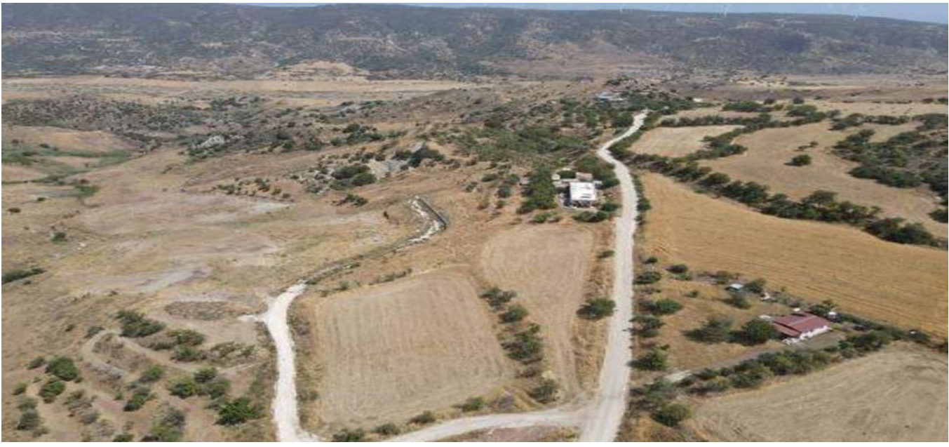
BANK OF CYPRUS PUBLIC COMPANY LTD (BOC) has made every reasonable effort to confirm and/or verify the information in this document. It is noted, however, that (a) this information was obtained from public records and/or third parties without the possibility of confirming their accuracy; and (b) BOC neither has possession nor is the owner of the property for sale, therefore the details in this document are provided solely for information purposes, without assuming any responsibility and/or duty and/or obligation by BOC to any person who may become aware of them. BOC strongly urges and/or strongly suggests that, with the help of specialized consultants of their choice, any Interested Buyers, conducts their own investigations and/or on-site examination of the property for sale to verify and/or obtain personal knowledge of all information and data that may affect the decision to participate in the upcoming auction of the property for sale