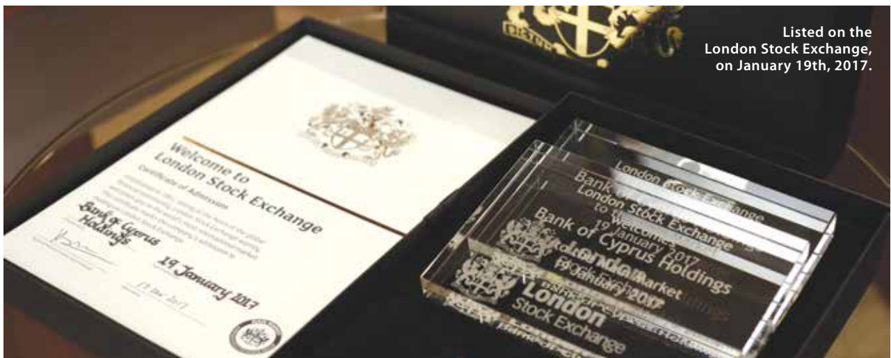
Listed on the London Stock Exchange, on January 19th, 2017.

This new culture of values of our new Bank forms the hallmark of the relationship with our shareholders, customers, regulators and other stakeholders.