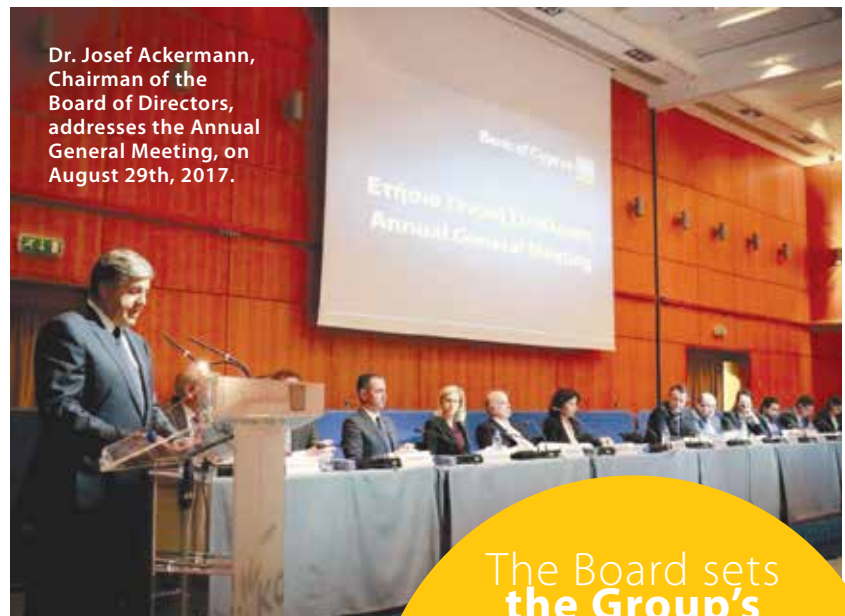
Dr. Josef Ackermann, Chairman of the Board of Directors, addresses the Annual General Meeting, on August 29th, 2017.

More information on our Corporate Governance can be found at Appendix "GRI Index".