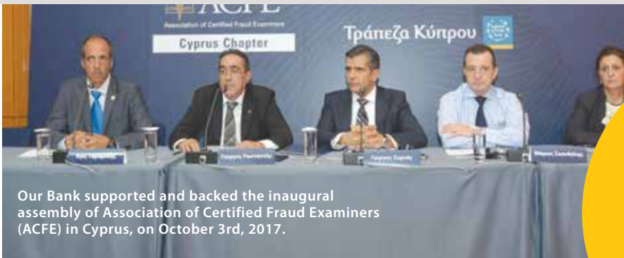
Our Bank supported and backed the inaugural assembly of Association of Certified Fraud Examiners (ACFE) in Cyprus, on October 3rd, 2017.

Based on Anti Money Laundering (AML) measures , the Bank rejected 1,354 potential customers and suspended 2,401 customer relationships of which 1,862 have been terminated.