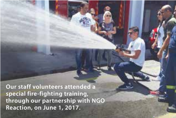
Our staff volunteers attended a special fire-fighting training, through our partnership with NGO Reaction, on June 1, 2017.