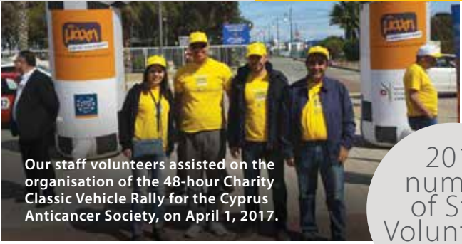
Our staff volunteers assisted on the organisation of the 48-hour Charity Classic Vehicle Rally for the Cyprus Anticancer Society, on April 1, 2017.