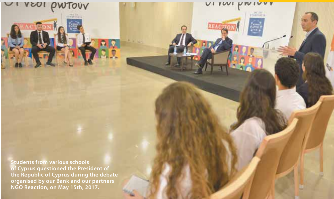
Students from various schools of Cyprus questioned the President of the Republic of Cyprus during the debate organised by our Bank and our partners NGO Reaction, on May 15th, 2017.

and the national team football players. Participation of more than 500 students in total.