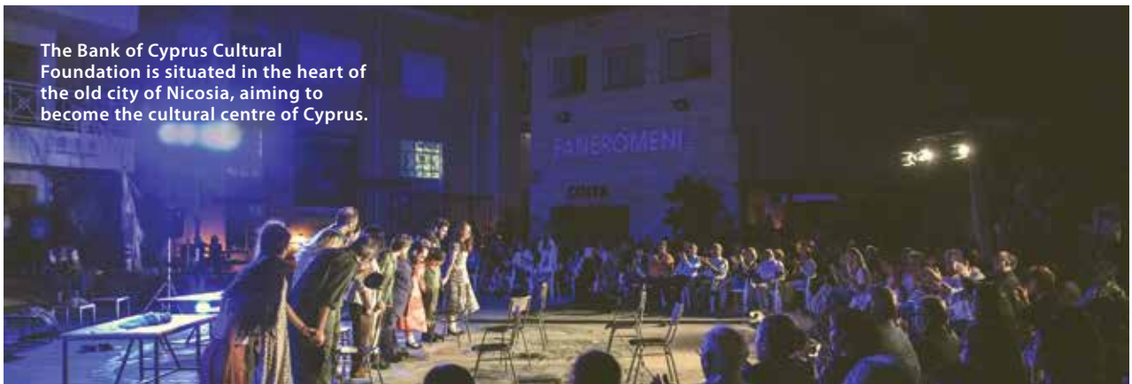
The Bank of Cyprus Cultural Foundation is situated in the heart of the old city of Nicosia, aiming to become the cultural centre of Cyprus.

In 2017 we supported more than 180 NGOs, charity organizations, associations, municipalities, schools, sports federations and sports academies with the amount of €1.2 million.