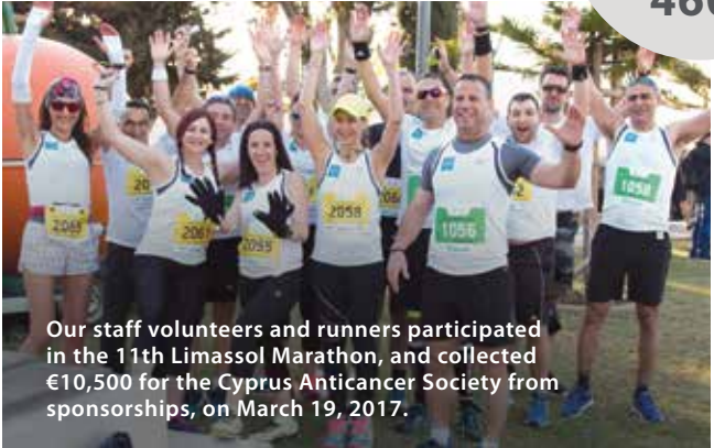
Our staff volunteers and runners participated in the 11th Limassol Marathon, and collected €10,500 for the Cyprus Anticancer Society from sponsorships, on March 19, 2017.