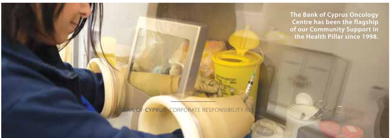
The Bank of Cyprus Oncology Centre has been the flagship of our Community Support in the Health Pillar since 1998.