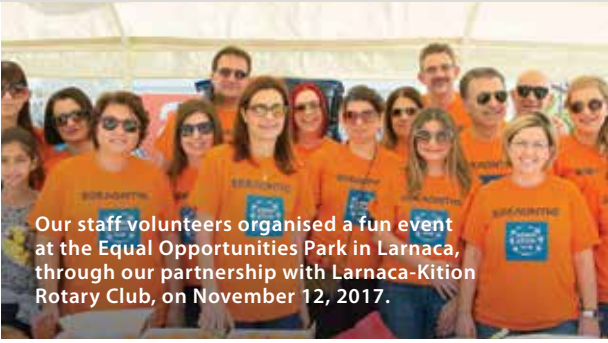
Our staff volunteers organised a fun event at the Equal Opportunities Park in Larnaca, through our partnership with Larnaca-Kition Rotary Club, on November 12, 2017.